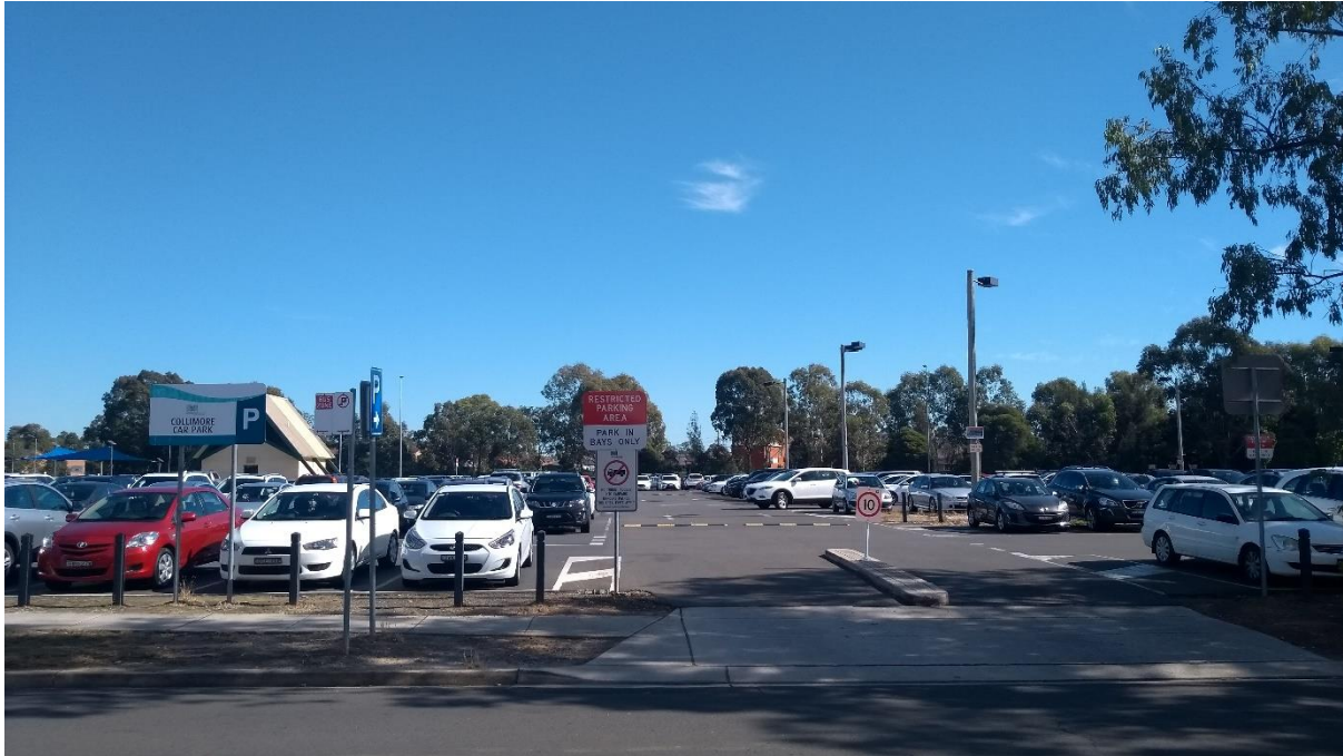
Figure 5 Looking at the subject site from Collimore Ave in a westerly direction